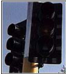
Traffic lights were out in several states

Most if not all customers had power restored by early Sunday, although some problems lingered.