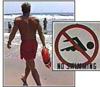
Spilled sewage caused beaches to close

"It's a shame because I can't stay out so long today," one sunbather said. "I can't cool off."