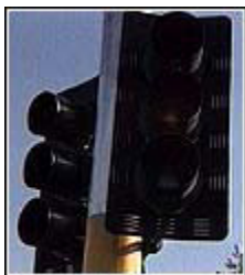
Traffic lights were out in several states

The 1977 Blackout came during a troubled time in New York City. The City was under tremendous financial stress, forcing government officials to cut back city services. These cutbacks fell most heavily on New York's working poor communities, since many relied on public services to ease financial hardships in a time of deep economic recession. Increased crime, which had risen dramatically in the previous decade, also added to the crisis. The summer of 1977 was known as the "Summer of Sam," named after David Berkowitz's nationally publicized murder rampage which sent the City into a state of constant fear verging on panic. When the lights went out on July 13th, unleashing what Time magazine called a "night of terror," New Yorkers wondered if their worst fears had finally come true. In a mixed metaphor that expressed his mixed feelings, one New Yorker asked, "if New York is the Big Apple, then why am I living in the pits?"